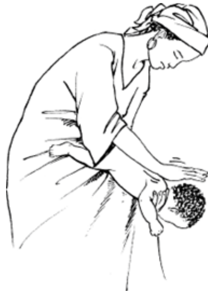
Fig. A2.2 Heimlich manoeuver on a choking baby