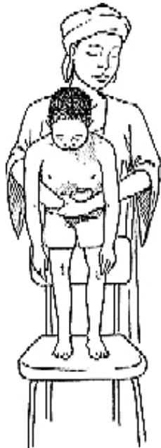
Fig. A2.1 Heimlich manoeuver on a choking child