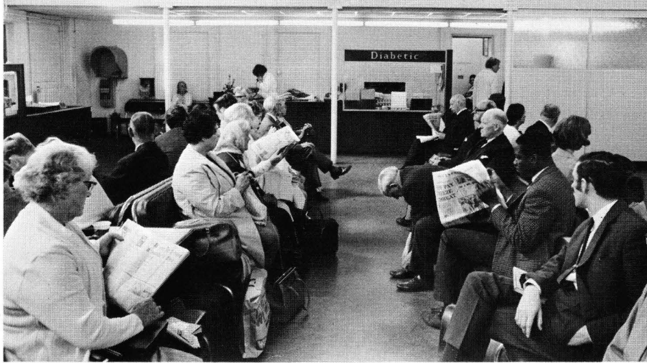
Patients waiting for a check-up at the diabetes clinic of a London hospital.