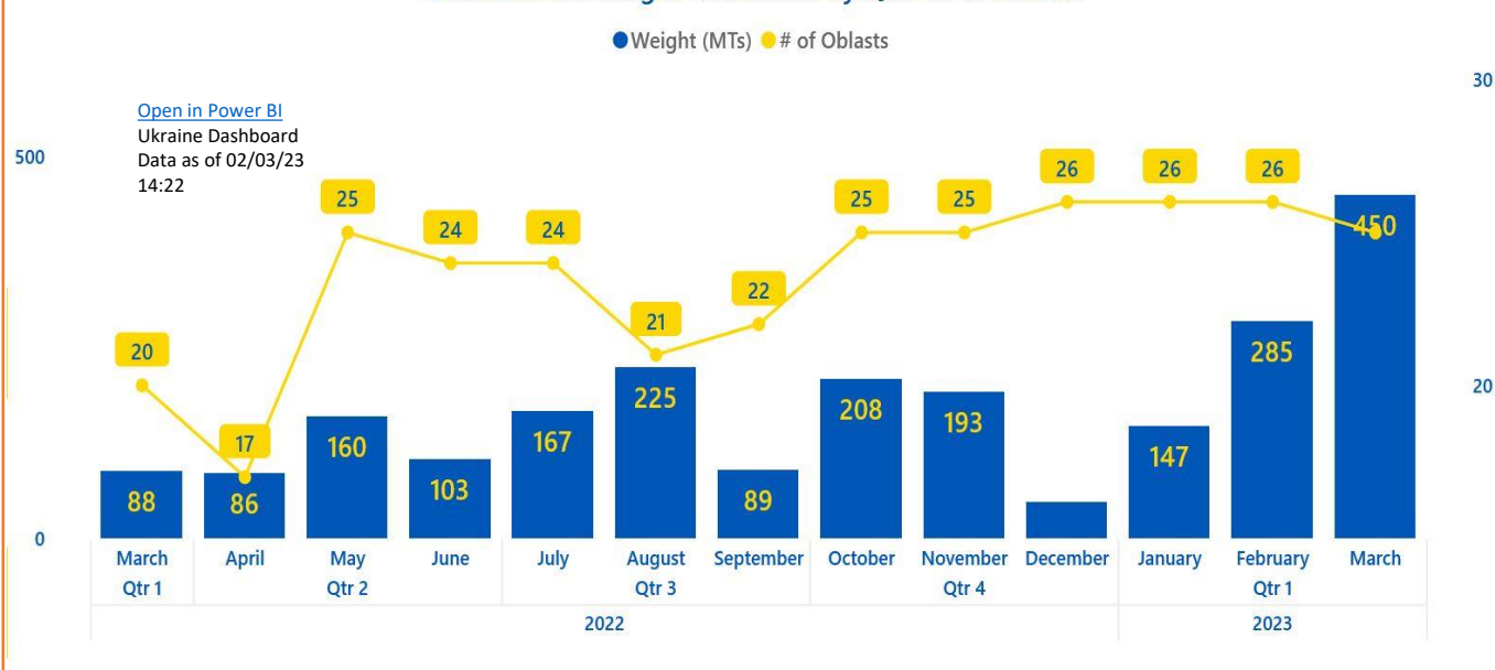
Breakdown of Weight Distributed by Quarter to Oblasts

The number of WHO modules delivered to Ukraine from 1 March 2022 to date